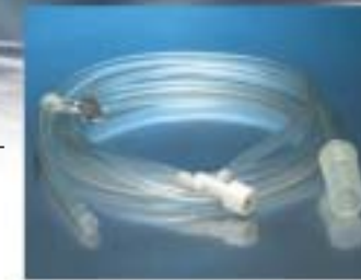
SELVS laparoscopic tubing kit with valve, sterile - 12/box