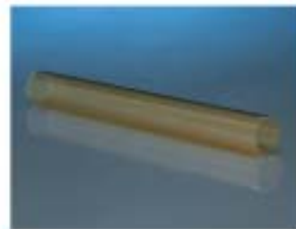
SELWS laser-resistant wand 7/8" x 8", sterile - 10/box