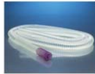
SETWS 7/8" x 6' tube with wand & tip, sterile - 24/box