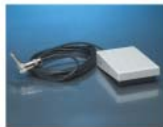
FSSE footswitch - 1/box