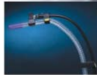
SEAS arm stand - 1/box