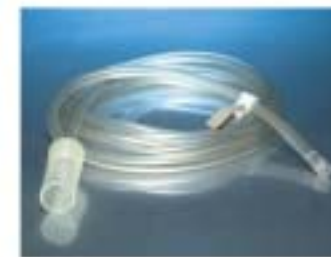
SELKS laparoscopic tubing kit, sterile - 12/box