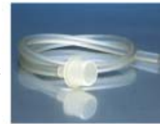
SERFS reducer fitting, sterile - 10/box