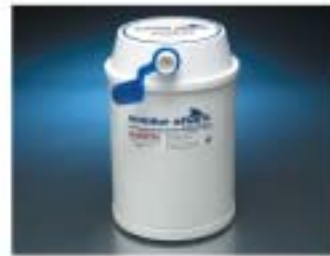
SF18 long-life 18-hour filter - 1/box