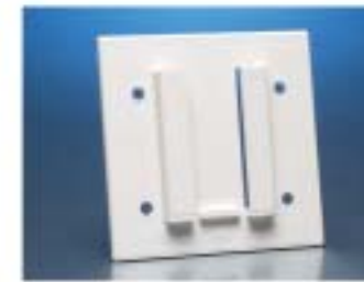
SEWP wall plate to hold canister - 1/box