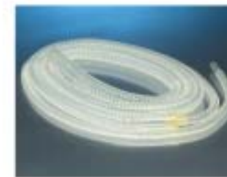
SEVL 7/8" x 6' tubing reduced to 3/8" for ValleyLab & IEC pencil, sterile - 5/box