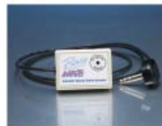
SERS remote switch activator - 1/box