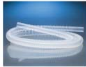
786T 7/8" x 6' tube, non-sterile - 24/box