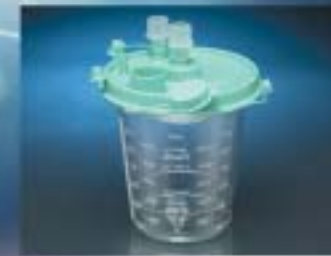
SEFC fluid collection canister 1200cc - 6/box