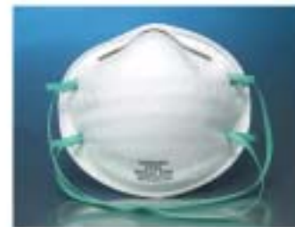
SEFM particle respirator cone mask - 20/box