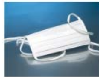
SELM laser mask - 50/box