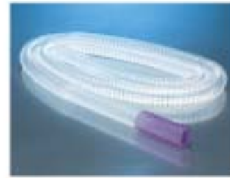
SETW 7/8" x 6' tube with wand & tip, non-sterile - 24/box