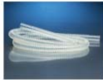
786TS 7/8" x 6' tube, sterile - 24/box