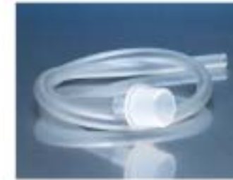
SERF reducer fitting 7/8" to 1/4" x 24" - 10/box [fits optional vaginal speculum or Aaron® ESP4 smoke & fluid evacuating pencil]