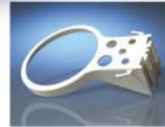
SERH canister ring holder - 1/box